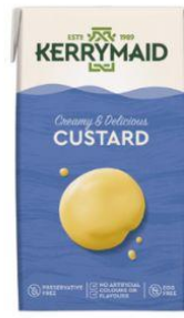
Kerrymaid UHT Custard (12 x 1ltr) Normally £21.95 / case NOW £19.95 / case