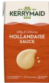
Kerrymaid RTU Hollandaise Sauce (1ltr) Normally £5.35 / each NOW £4.25 / each