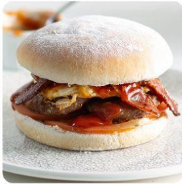
Frozen Kara 5" Floured Burger Bap (48) Normally £10.75 / case NOW £9.95 / case