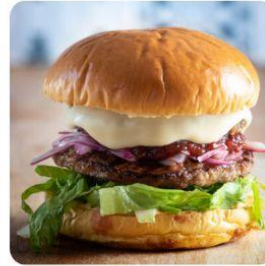
Frozen Kara 4.5" Sliced Brioche Bun (48) Normally £19.50 / case NOW £18.00 / case