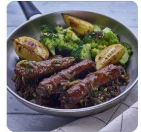
Frozen Katerveg Vegan Sausage (40 x 50g) Normally £14.75 / box NOW £13.75 / box