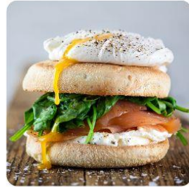
Frozen Kara English Breakfast Muffins (48) Normally £14.50 / case NOW £13.50 / case