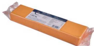
Exton's Burger Cheese Slices (88) Normally £6.50 / pack NOW £5.95 / pack