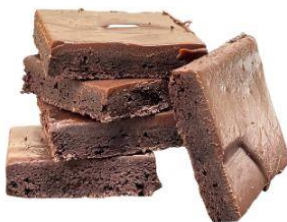
Frozen Chocolate Brownie Unsliced Slab (20-30 ptn) ONLY £20.00 / case WHILE STOCKS LAST! (Un sliced approx 35 x 40cm)