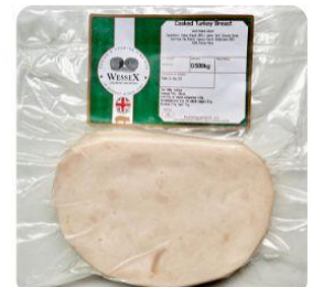
Sliced Cooked Turkey (500g) Normally £16.50 / kg NOW £14.50 / kg

To place your order call us today on 01202 440900!