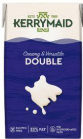
Kerrymaid UHT Double Cream (12 x 1ltr) Normally £48.50 / case NOW £42.50 / case