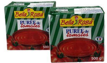
Italian Tomato Passata (12 x 500g) Normally £12.00 / case NOW £10.50 / case