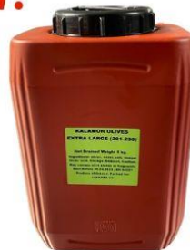
Whole Greek Kalamata Olives (5kg) Normally £33.95 / tub NOW £31.50 / tub